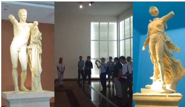
Fig. 9 Guided tour at Olympia's archaeological museum spending much time in front of the famous statues of Hermes of Praxiteles and Niki (= victory) of Paionios