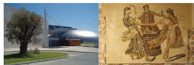
Fig. 6 Entrance of Patras Archaeological Museum - Floor mosaic (Three Graces) 2-3 century CE (AD)

On the last day of the conference (July 8), a cultural activity took place, by visiting the nearby imposing bridge of 2860 m (as shown in Fig. 1, it became symbol of ICTF 2016), Patras archaeological museum (Fig. 6) and Ancient Olympia (archaeological museum and site, including the ancient stadium of the Olympic Games).